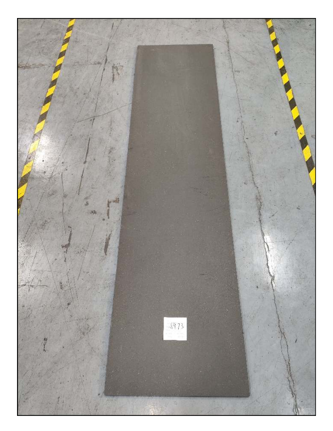
SGS authenticate the photo on original report only ***End of Report***